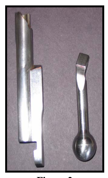
Figure 2 Military bold handle removed and Rock Solid bolt handle