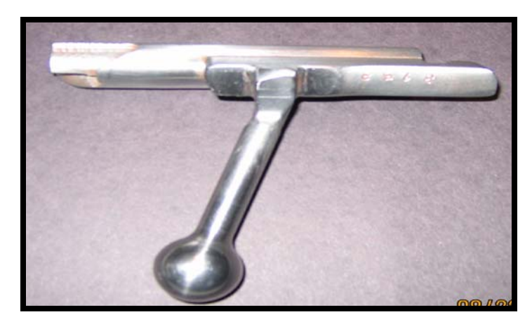
Figure 3 Rock Solid bolt handle installed

Note : Place Rock Solid handle in same location as military handle using the top of the Rock Solid handle as a guide for alignment.