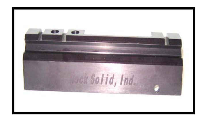
Anchor Screw Side